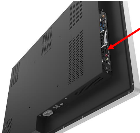
Figure 2 OPS PC Connection