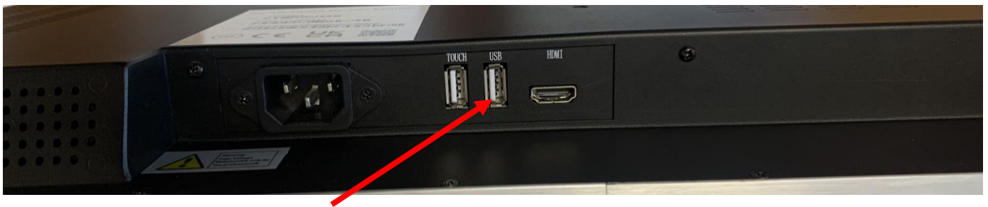
Figure 6 USB Port Location

Insert the USB stick into the USB port of the screen. You can locate the USB port by referring to Figure 6.