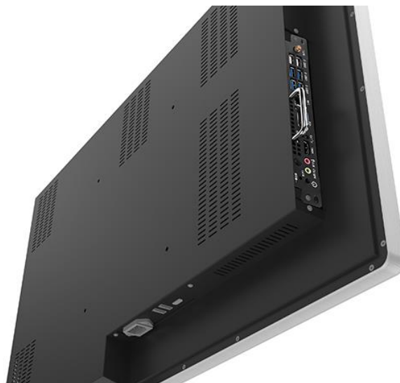
Figure 4 Screen Inputs

OPS Slot: The OPS Slot is designed to accommodate an OPS PC, allowing you to insert it into the PCAP screen for integrated functionality.