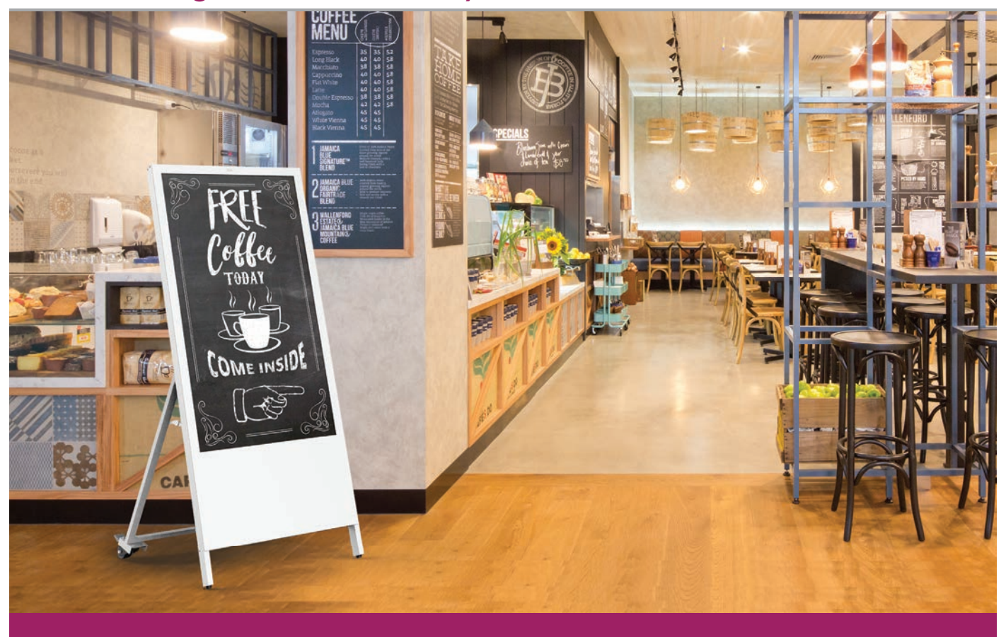
Fully portable digital sandwich board, perfect for when ultimate location flexibility is required