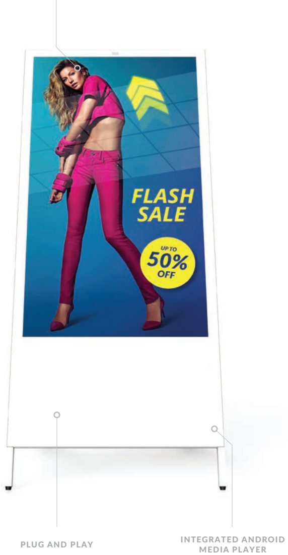
OPTIONAL NETWORK UPGRADE