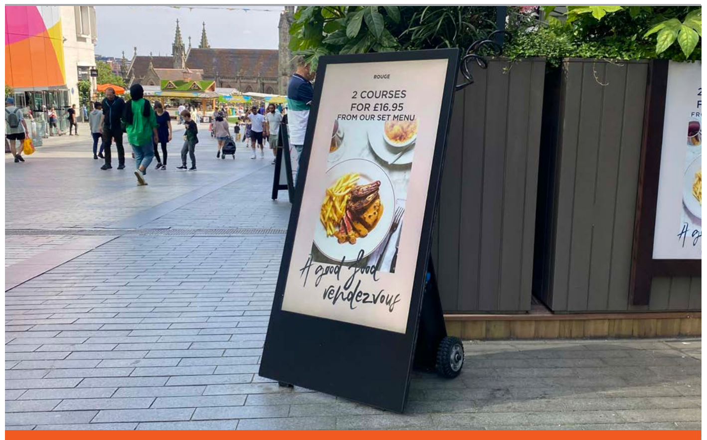
Fully portable solution for any space; display content all day and night on a single charge