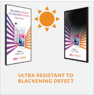
ULTRA RESISTANT TO BLACKENING DEFECT