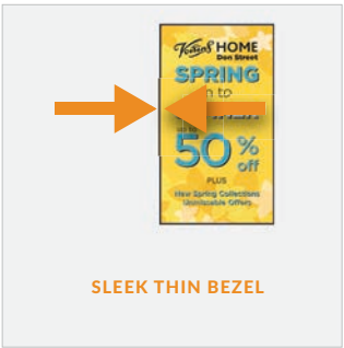
SLEEK THIN BEZEL