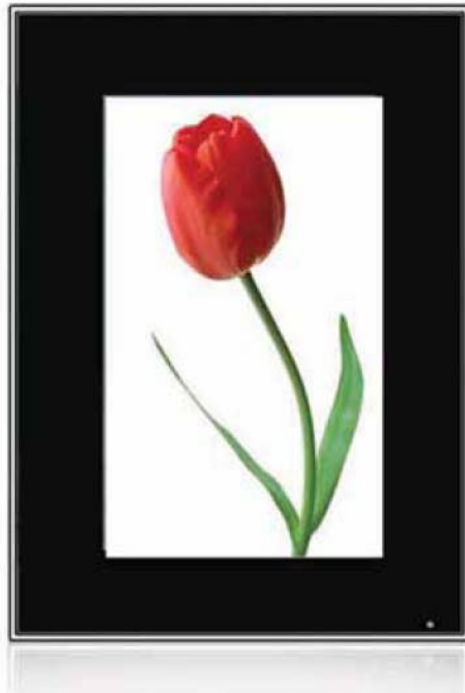
40 Inch Digital Poster Display V40A1